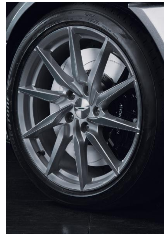
Winter Wheel and Tyre Kit