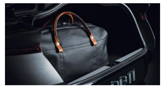
4-Piece Luggage Set